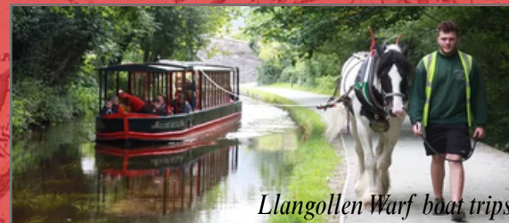
Llangollen Warf boat trips